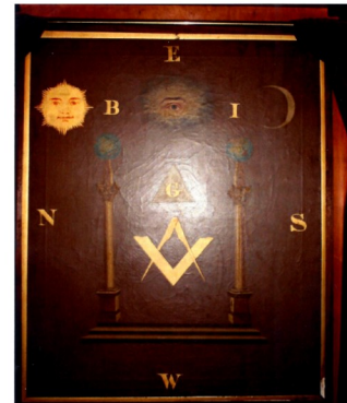
Second Degree Tracing Board.

This Board is believed to date from 1606.