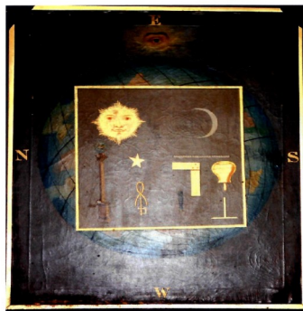
First Degree Tracing Board.

This Board is believed to date from 1606.